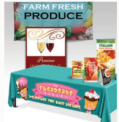
Food and Beverage